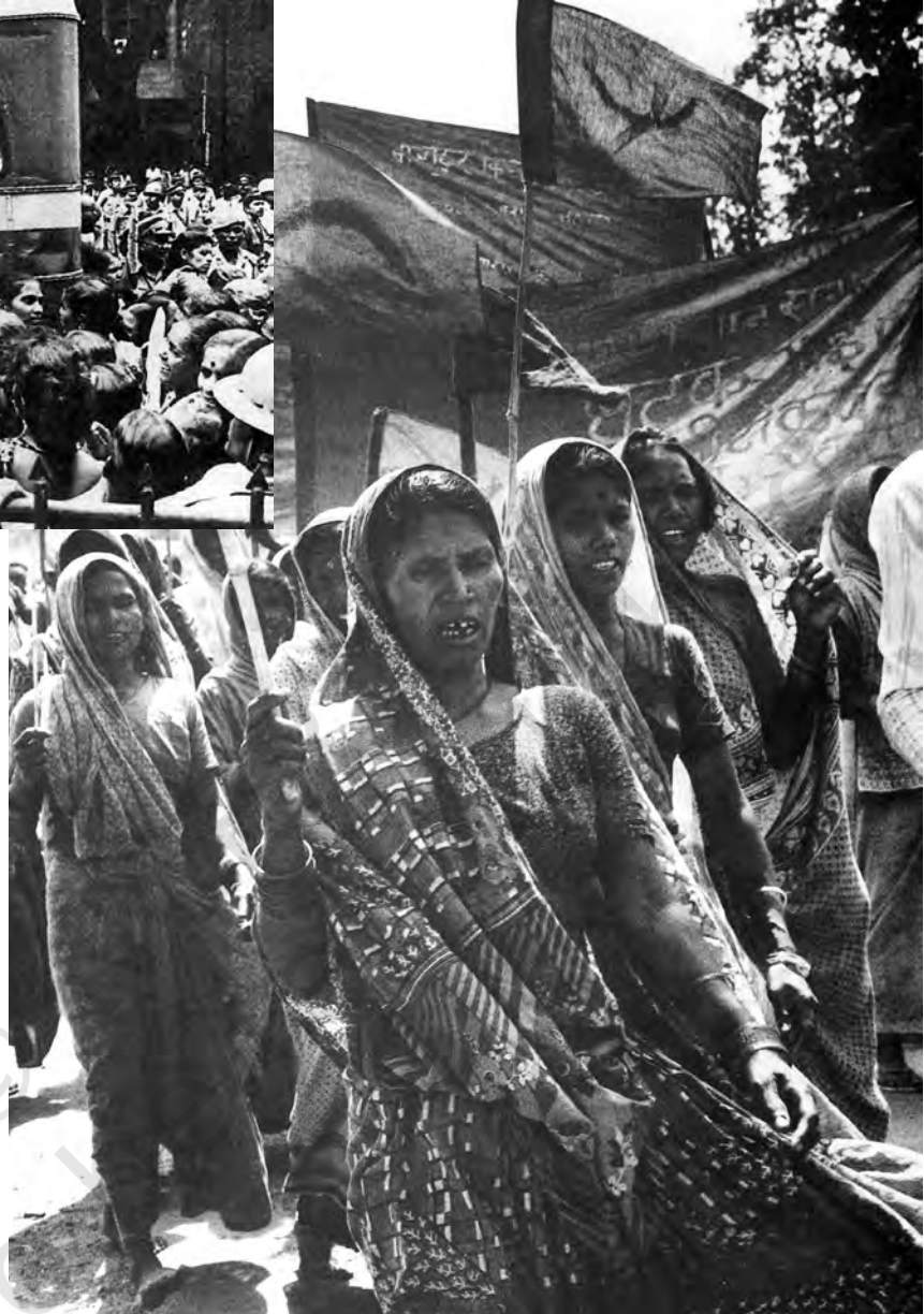
Right: Women workers at a Union Demonstration, Arwal, Bihar 1987