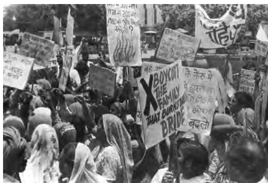
Struggle against dowry