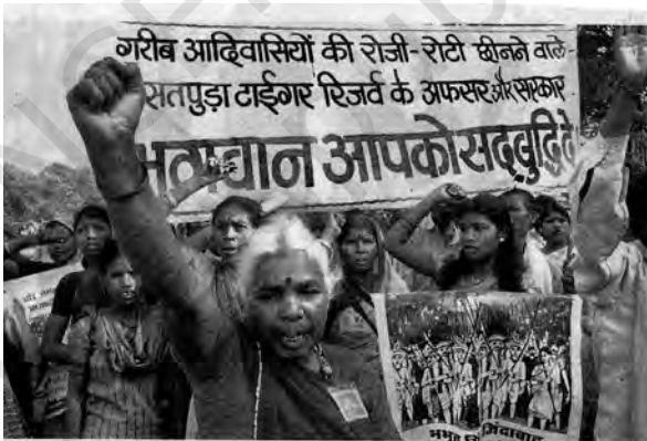
Struggles of the tribals continue

Different tribal groups spread across the country may share common issues. But the distinctions between them are equally significant. Many of the tribal movements have been largely located in the so called 'tribal belt' in middle India, such as the Santhals, Hos, Oraons, Mundas in Chota Nagpur and the Santhal Parganas. The region constitutes the main part of what has come to be called Jharkhand.